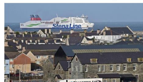
Holyhead Port in Wales. Exporters, importers, and Government officials are increasingly concerned about the huge changes that are coming down the road as the accords under the long-delayed Trade and Cooperation Agreement finally come into place.